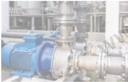
BOMBAS DE AGUA