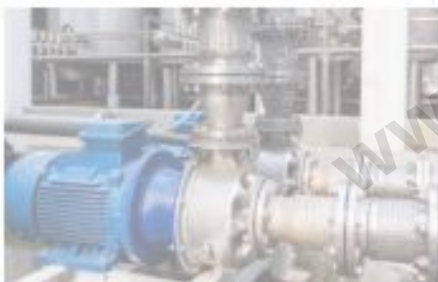
BOMBAS DE AGUA